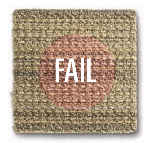
COMPETITOR TOPICALS WEAR OFF CAUSING THEM TO FAIL

Duracolor passes this test because its stain protection is an inherent property that cannot wash off or wear away. It does not use a topical treatment.