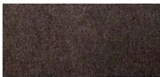
Type A: Needle punch - Brown