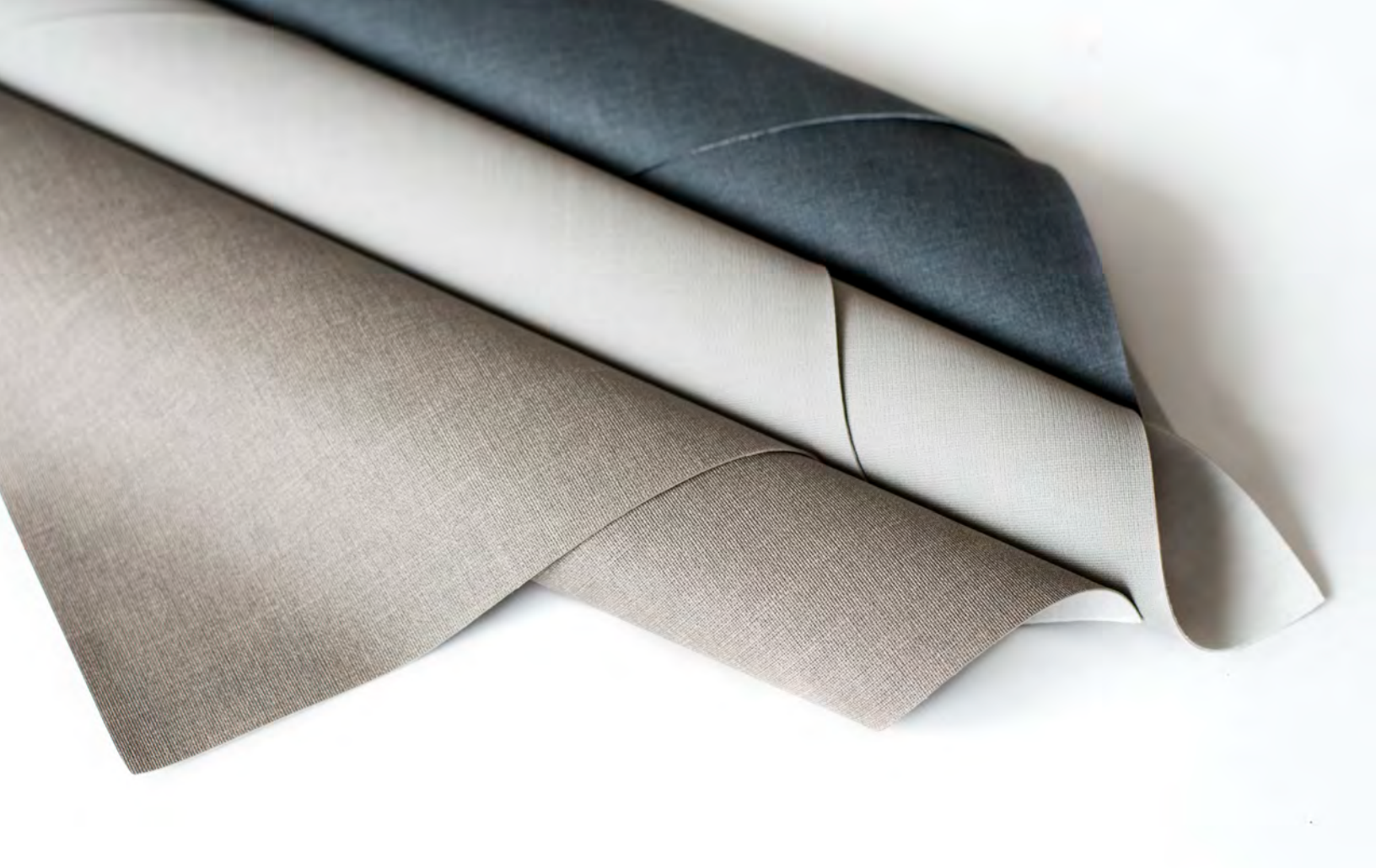
SKYE Phthalate Free Vinyl

Coined after Ireland's Isle of Skye, Skye is a coated fabric that is reminiscent of Irish linen. The embossed texture provides the phthalate free, performance vinyl a fine woven appearance. Skye is bleach cleanable and boasts over 250,000+ double rubs for a wide range of applications.