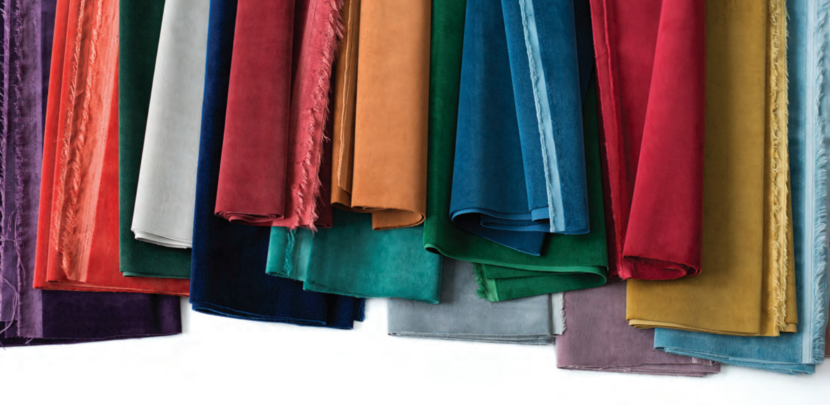
SPECTRA High Performance Velvet